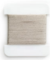
WARM PEWTER Denier: 1245 G276