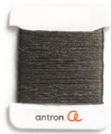
MOONLESS NIGHT Denier: 895 G1272