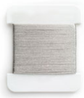
SILVER Denier: 1245 G170