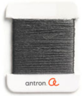
SHOT GRAY Denier: 895 G1534