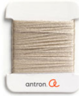
CHRYSANTHEMUM Denier: 895 G2768