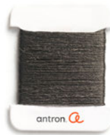
STARRY NIGHT Denier: 895 G1355