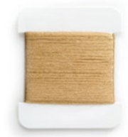
GOLD Denier: 1245 G470