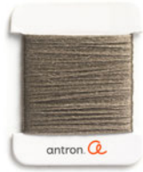
ROCKET LAUNCH Denier: 895 G2756