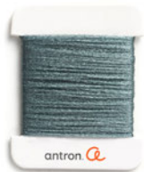
BLUE SATURN Denier: 895 G7104