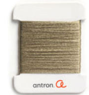
BRONZE SCREECHER Denier: 895 G4817