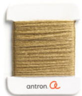
GOLDEN DAWN Denier: 895 G3748