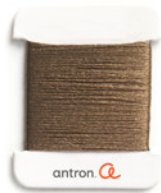
BURNT COMET Denier: 895 G4514