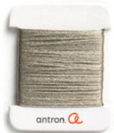
GREEN SERPENT Denier: 895 G5057