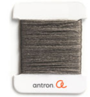
BROWN TROUT Denier: 895 G2804