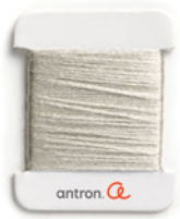
STROBE EFFECT Denier: 895 G1014