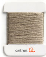
ALUMINUM Denier: 895 G4558